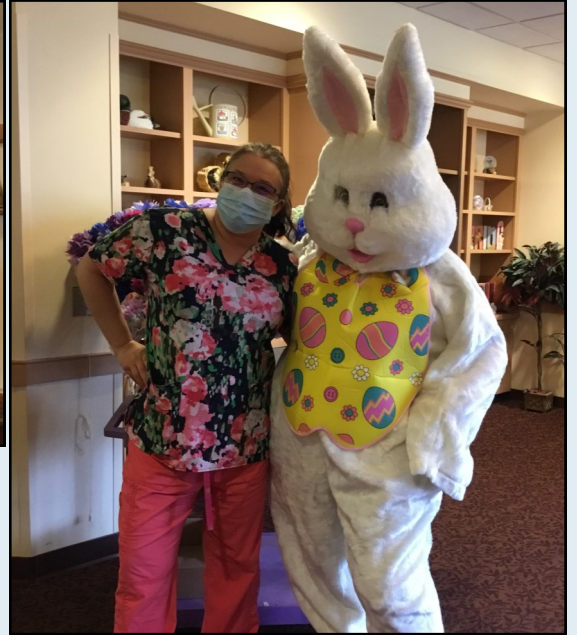
Having fun with Easter Bunny!