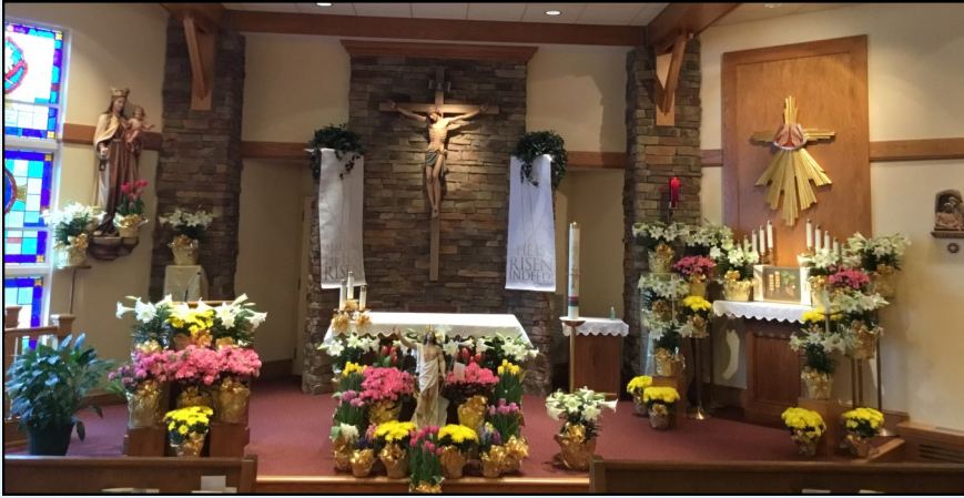
St. Joseph's Chapel